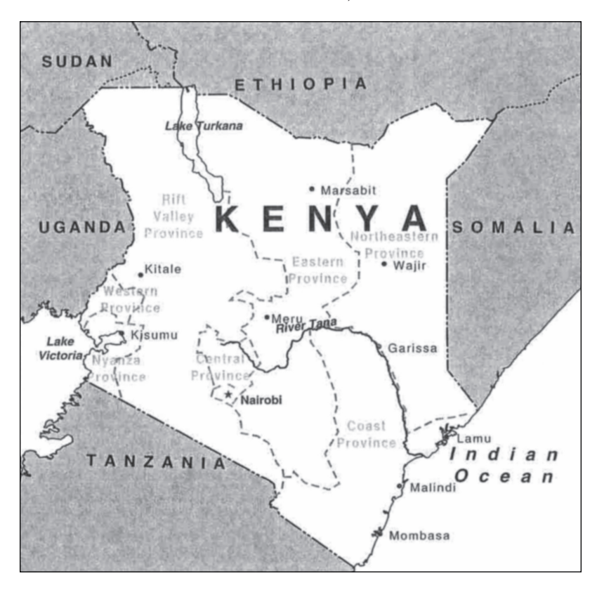
This map of Kenya shows the provincial administrative boundaries with the major towns.