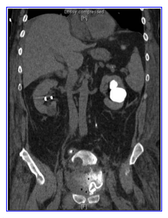
FIG. 2. CT saggital abdomen/pelvis with contrast. Disruption of vesicourethral anastomosis with bladder displaced superiorly.

Six months postoperatively the patient underwent routine exchange of the urethral foley catheter and SPC, in addition to retrograde urethrogram and cystoscopy. Intraoperative