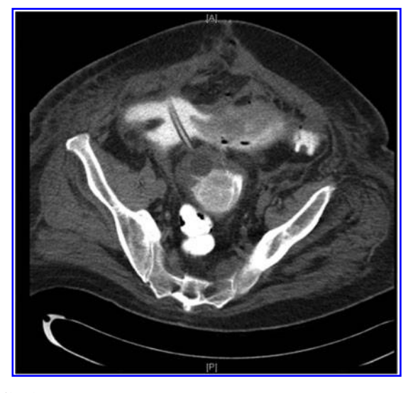
FIG. 1. CT axial abdomen/pelvis with contrast. Extravasation of contrast from bladder. Large pelvic hematoma in close proximity to bladder. CT, computed tomography.

percutaneous nephrostomy (PCN) tubes. Given the degree of VUA, retrograde bilateral stents would likely be quite difficult to place and were therefore deferred. Pelvic drains were removed on POD44. Patient was discharged and underwent several periodic endoscopic evaluations that consisted of cystoscopy and cystogram. Bilateral PCNs removed on postoperative day 90.