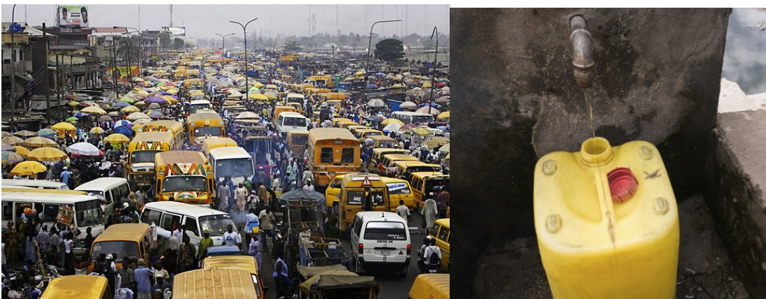
Public vehicles and street vendors in Lagos; filling a jerrycan at a public fountain