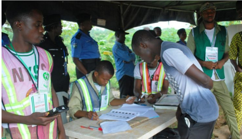
Voting in Ekiti's gubernatorial election, July 2018. (Eagle Online)

A striking example of how citizens can rise up to reclaim security from state institutions and political elites is the current Yellow Vest movement in France. Nigerians, who engaged in mass protests in January 2012 against sharp increases in petroleum prices, were moved as their French counterparts by sentiments of “economic insecurity”, “social distress”, “distrust of institutions”, and “hatred of the winners in the global system”. ( New York Times , 6 December 2018). As is evident in many countries today, populist anger can be captured and channeled by authoritarian nationalism. It can also be manipulated, as Professor Osundare says of Nigeria, by demagoguery, vote-buying, and electoral thuggery.