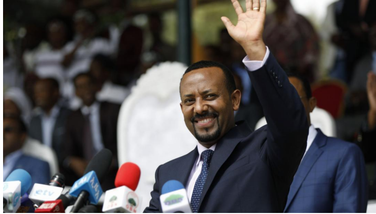
Abiy Ahmed, Ethiopian Prime Minister since April 2018, waves to a crowd.

Even when dimmed in one country, the lamps of liberty can shine through from another. Ethiopians look in particular to Nigeria as they rethink their ethnic federal system. During an era of “democratic backsliding”, looking to the past can help us peer into the future. Contemporary challenges are mirrored, and we benefit from unearthing intellectual, social, and policy responses. In this spirit, I intend to make much of what I have learned about the Nigerian experience widely accessible.