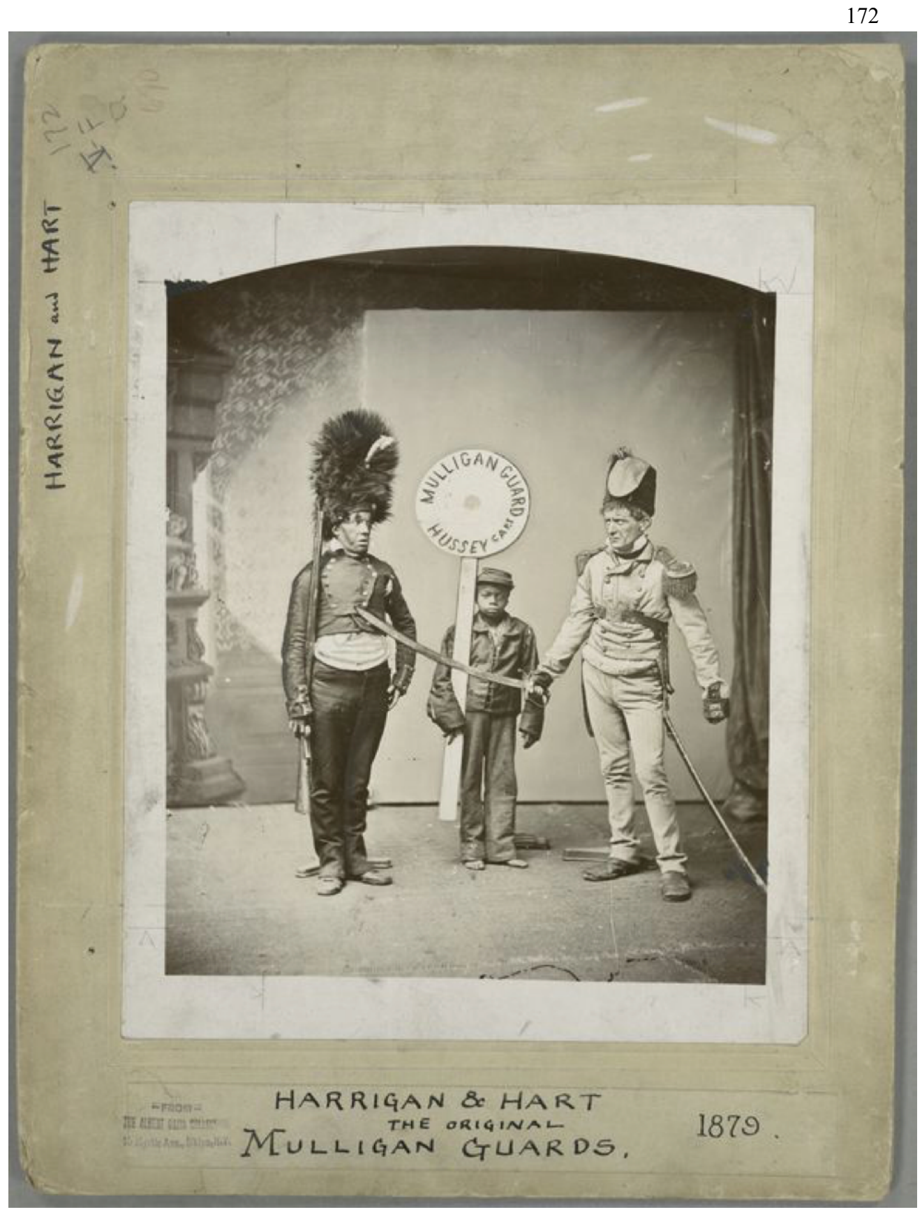
Figure 5. Harrigan & Hart in The Mulligan Guards (1874)