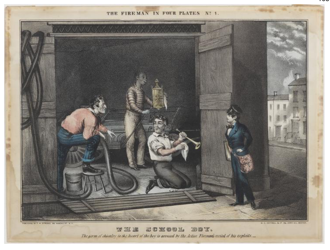
Fig. 1. The School Boy (Plate No. 1) from "The Fireman in Four Plates" (c. 1850)

While documentation of black participants in the City's fire safety organization of the early nineteenth century remains thin, there is one place where we may turn to investigate how blacks were thought to belong to the City in relation to civic duty. This is an important question to consider concerning labor and the constitution and continuation of an embedded racial structure of and for civic belonging. To what end is the legacy of slavery, the black quasi-citizen, publicly greeted upon the civic social stage of public engagement? What were the structures established to re-introduce fellow publics albeit draped in new altogether possibly different public appearance. The slave no longer, the freeman