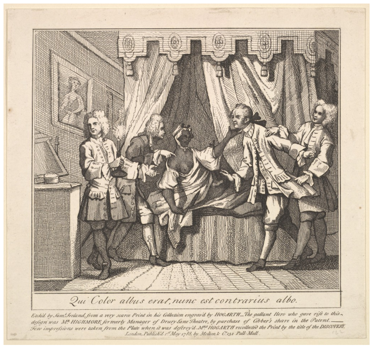
Figure 2. Hogarth, The Discovery (c. 1843).

most common pattern - substituting a black servant in the bed for a chaste white mistress - connects issues of gender and sexuality with clearly defined racial constructions and class consciousness."<sup>140</sup>